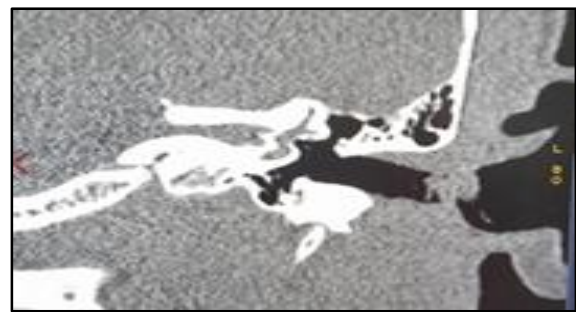
Figure 2: Type B